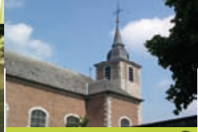
Eglise de Thon